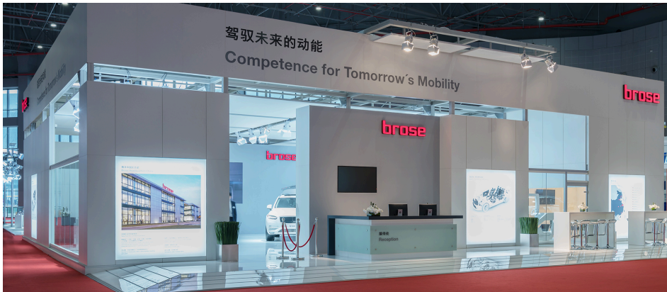
"Competence for Tomorrow's Mobility" is Brose's theme for Auto Shanghai 2017.

Shanghai (20. April 2017) Shanghai (20 April 2017). "Competence for Tomorrow's Mobility" is Brose's theme for the Auto Shanghai 2017. The technological leader in mechatronics for doors, seats and electric drives is showcasing developments and ideas that make driving safer, more comfortable and efficient in the future. A side door drive enables easier vehicle access and can also be controlled via a smartphone. With its fully electrified seat platform, the company is underscoring its vision of flexibly adaptable interiors. And the supplier is taking a step towards system expertise in drive train actuators with its electric oil pump. Regarding comfortable vehicle access Brose sets new standards: With its drive for side doors, the company is presenting a new modular solution for comfortable vehicle access. The innovation moves hinged doors electrically and offers optional control via mobile end devices. A capacitive anti-trap protection feature ensures the necessary level of safety when the door is being shut.