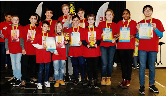
The X-Rays from the Röntgen-Gymnasium Würzburg are the champions of this year's regional competition of the First Lego League.