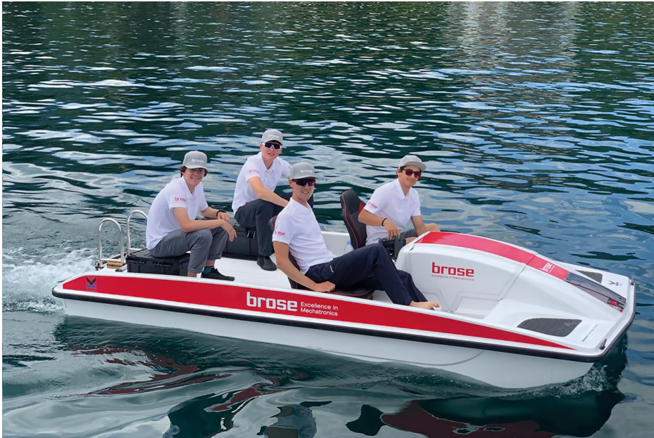
As in the car race, the four young men took turns.