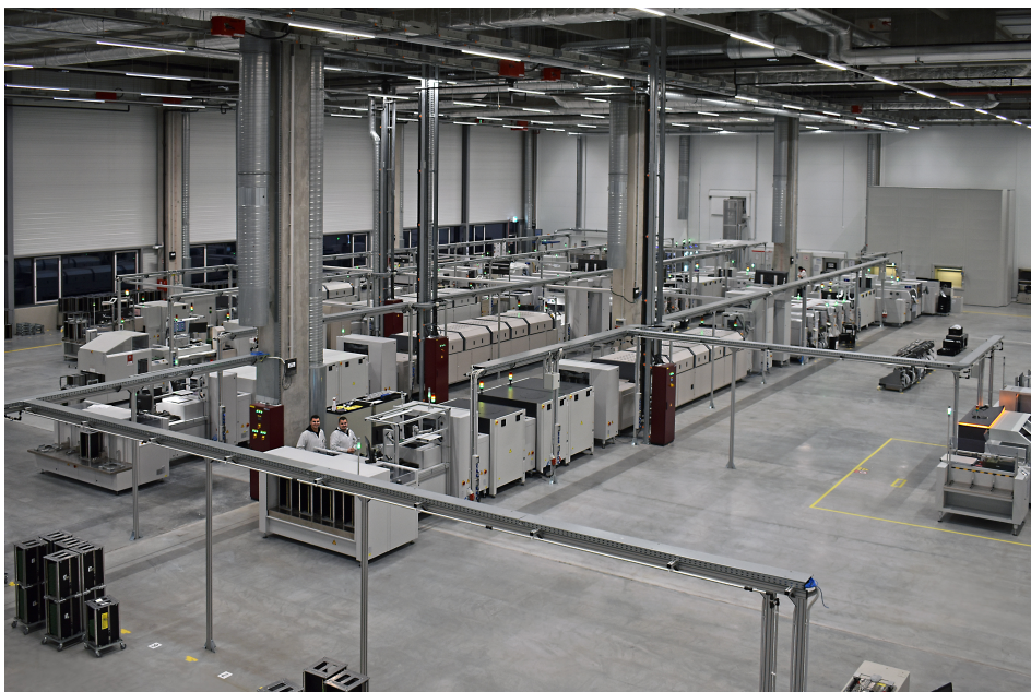
Brose is investing in state-of-the-art electronics manufacturing in Belgrade/Serbia.